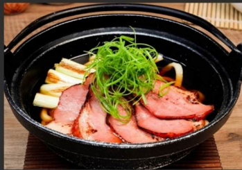
☎ Kamo Negi 490 鴨ねぎうどん smoked duck udon