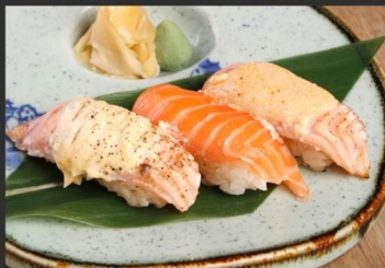
Salmon Trio サーモン三昧 assorted salmon nigiri 340