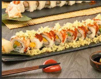
🍷 Golden Dragon Roll 780 ゴールドドラゴンロール kanikama, ripe mango, cucumber, topped with unagi