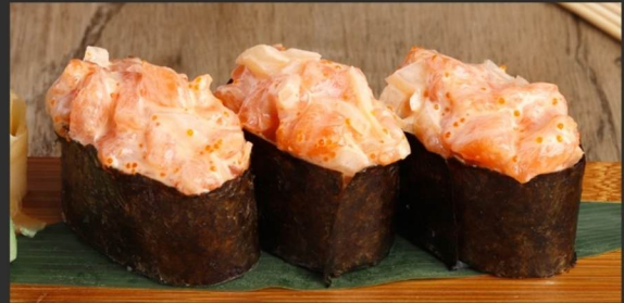
Spicy Salmon Gunkan 370 スパイシーサーモン軍艦 spicy salmon in a thin strip of nori