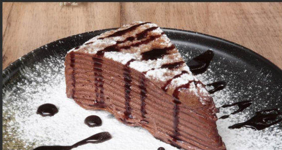
Chocolate Mille Crepe チョコレートミルクレープ