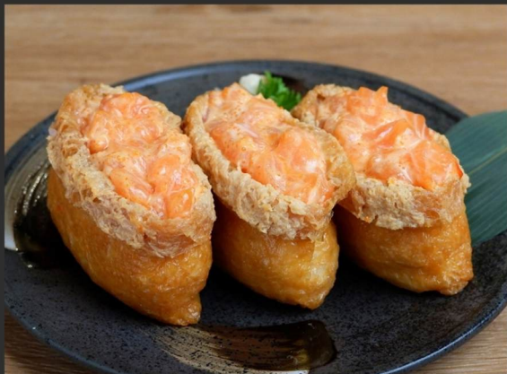
Spicy Salmon Inari 450 スパイシーサーモンいなり fried tofu skin with spicy salmon