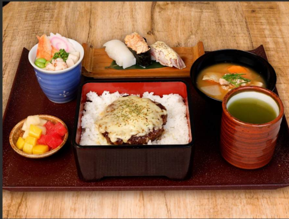
Wagyu Beef Hamburg Jyu 和牛ハンバーグ御膳 wagyu beef hamburg, rice

includes sen-ryo chawanmushi, rice, miso soup, assorted nigiri, fruit, tea