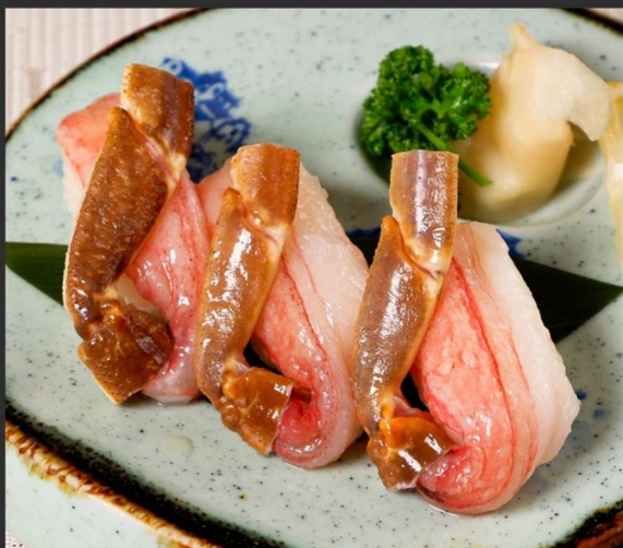
Premium Snow Crab Nigiri ズワイガニ握り