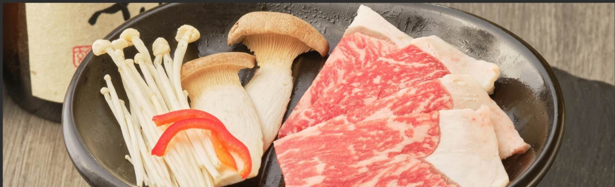
☎ Grilled Wagyu Beef 1050 和牛ステーキ grilled wagyu beef striploin