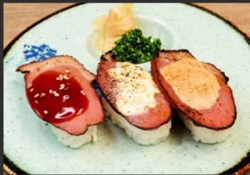
Smoked Duck 260 燻製鴨三昧 assorted smoked duck nigiri