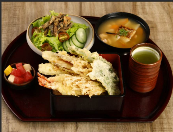
Ten Jyu 天重御膳 assorted tempura, rice