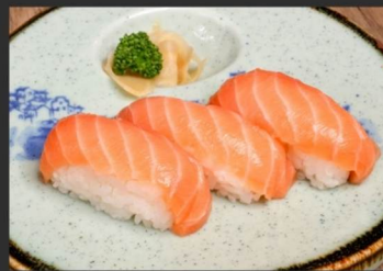
Salmon Nigiri サーモン Norwegian fresh salmon