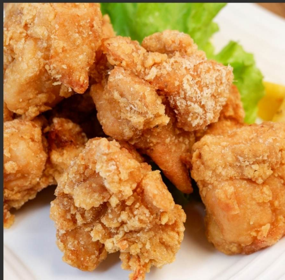
🍴 sen-ryo Premium Chicken Karaage 千両プレミアム唐揚げ Japanese fried chicken