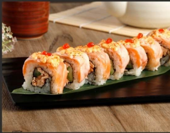
🍷 Spicy Double Salmon Roll 680 スパイシーダブルサーモンロール cucumber, seared salmon, salmon roe