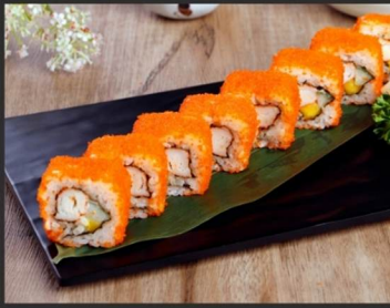
California Roll 450 カリフォルニアロール kanikama, ripe mango, cucumber, shrimp roe