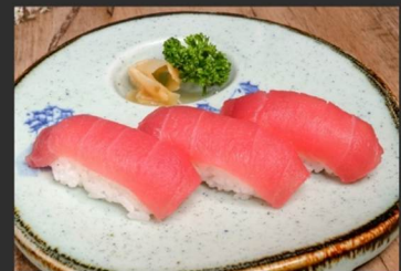
Maguro Nigiri 鮪 tuna