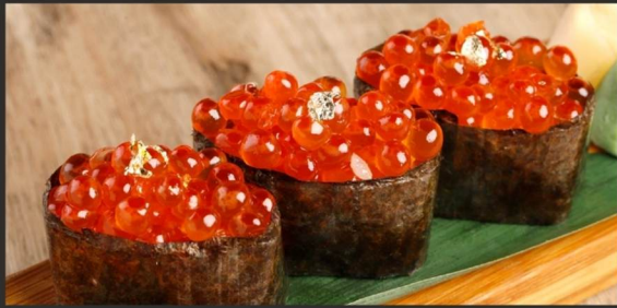
🍣 Salmon Roe Gunkan 650 いくら軍艦 salmon roe in a thin strip of nori