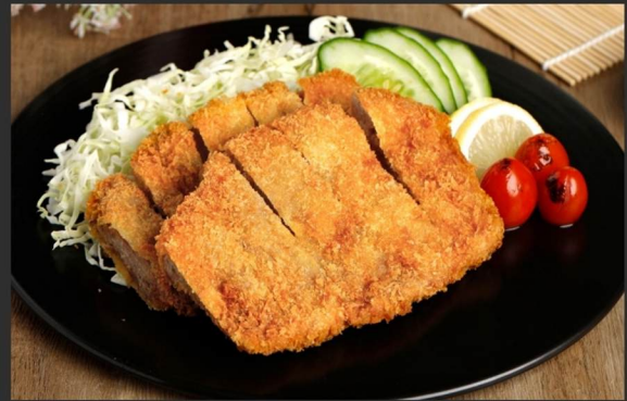
Pork Tonkatsu 720 とんかつ deep fried pork cutlet