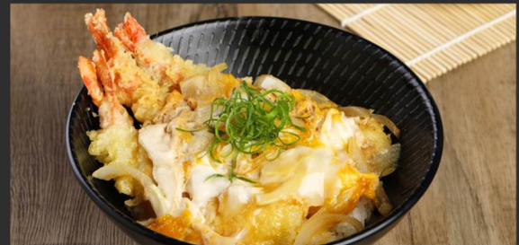
Ebi Tempura Don 440 えび天丼 shrimp tempura, rice