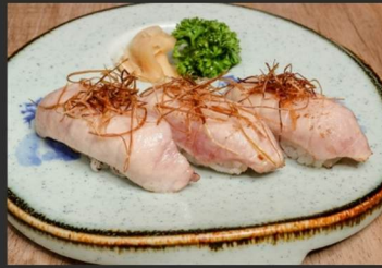
Seared Maguro Nigiri まぐろ炙り seared tuna 340 (〒)