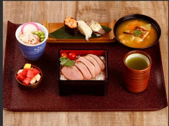
Smoked Duck Jyu 燻製鴨御膳 smoked duck, rice