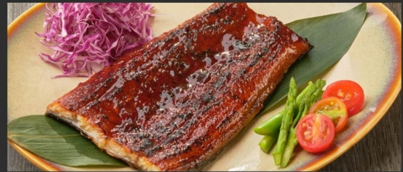
Grilled Unagi 880 鰻蒲焼き grilled river eel with special sauce