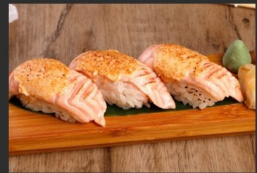
(〒) Seared Salmon with Pollock Roe Nigiri サーモン明太炙り seared salmon with pollock roe and mayo 340