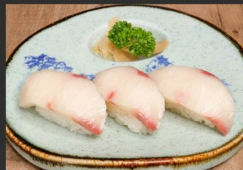
🍴 Hamachi Nigiri はまち yellowtail