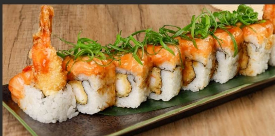
🍣 Shogun Roll 540 将軍ロール shrimp cutlet roll with spicy salmon