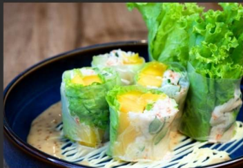
sen-ryo Spring Roll 300 千両生春巻 mango, kanikama, lettuce, wrapped in fresh rice paper, special sauce