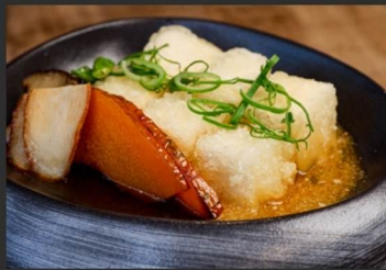
sen-ryo Agedashi Tofu 260 千両揚げ出し豆腐 traditional tofu served in a flavorful special sauce