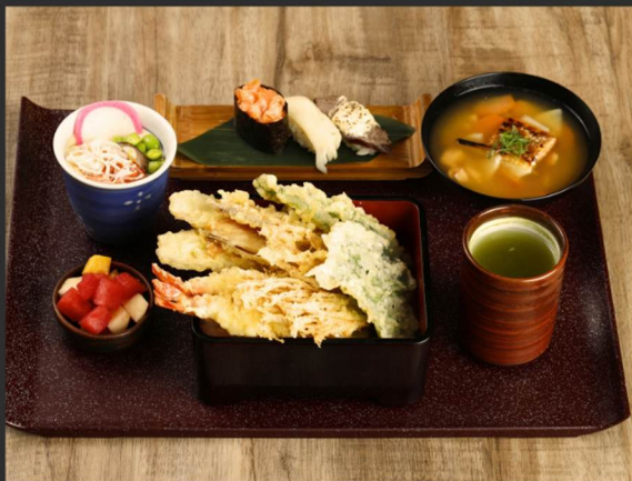
Ten Jyu 天重御膳 assorted tempura, rice