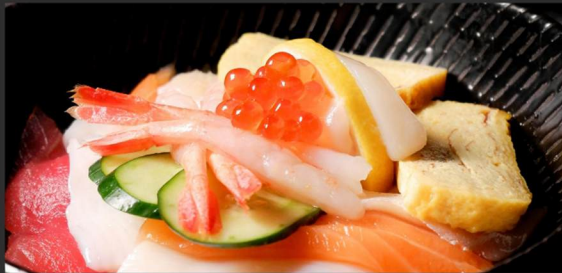
Premium Chirashi Don 890 プレミアムちらし丼 premium sashimi, sushi rice