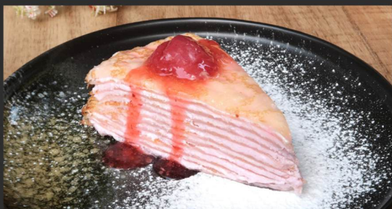
Strawberry Mille Crepe ストロベリーミルクレープ