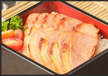
Smoked Duck Donburi 390 燻製鴨丼 smoked duck, rice