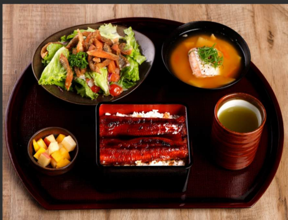
Una Jyu 鰻重御膳 unagi, rice