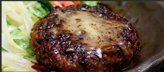
Wagyu Hamburg Steak 650 和牛ハンバーグ wagyu hamburg with melted cheese