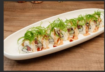
Smoked Duck Roll 380 スモークダックロール smoked duck, cucumber, cream cheese