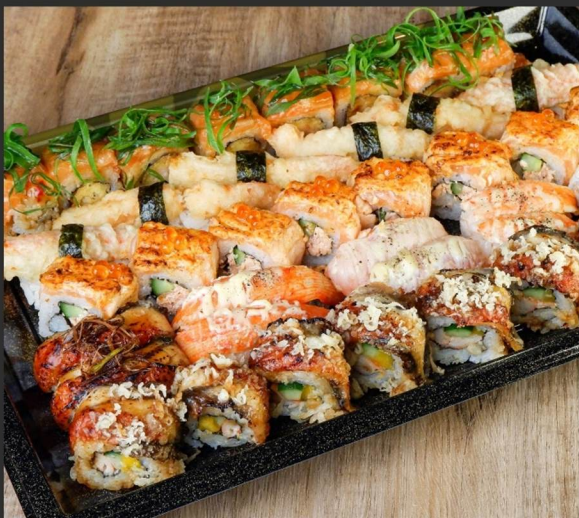
Premium Family Platter 3400 プレミアム ファミリー プラッター 40 pcs assorted sushi · golden dragon roll, spicy double salmon roll, shogun roll, seared hamachi with steak sauce nigiri, unagi nigiri, seared kanikama with black pepper nigiri, seared salmon with black pepper nigiri, seared shrimp with black pepper nigiri, tempura shrimp nigiri, tempura kanikama nigiri