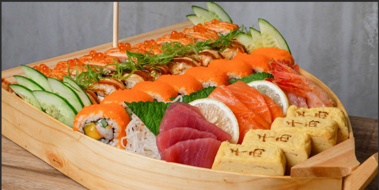
sen-ryo Sushi Boat Platter 2500 千両寿司ボート Assorted sushi served in a Japanese style sushi boat