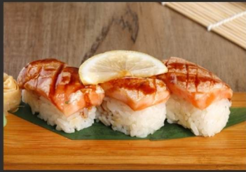
Seared Salmon Belly with Teriyaki Nigiri とろサーモン照り焼きソース炙り seared salmon belly with teriyaki sauce 340