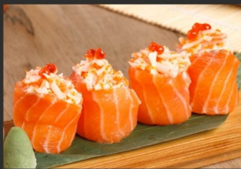
🍴 Hana Kani Sushi 花かに寿司 salmon nigiri topped with kani and salmon roe