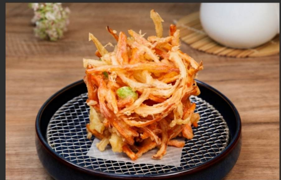
Seafood Kakiage 390 海鮮かき揚げ shrimp, squid, edamame, pumpkin, carrot, onion