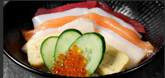
Chirashi Don 790 ちらし丼 seasonal sashimi, sushi rice