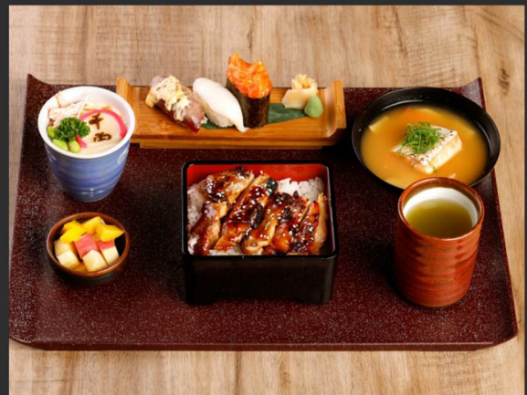
Chicken Teriyaki Jyu チキン照り焼き御膳 chicken teriyaki, rice