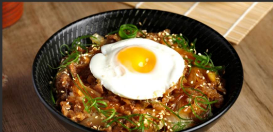
Gyu Don 400 牛丼 sauteed beef, rice