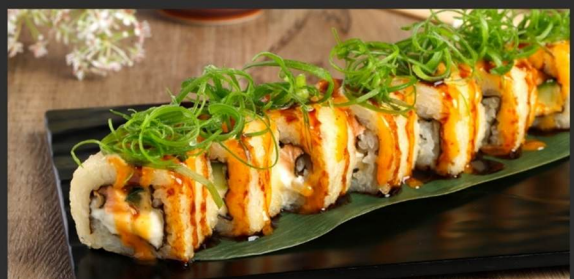
Salmon Cheese Tempura Roll 450 サーモンチーズ天ぷらロール fried salmon cheese roll