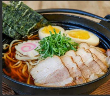
Pork Chashu Ramen 520 チャーシュー麺 ramen with pork chashu