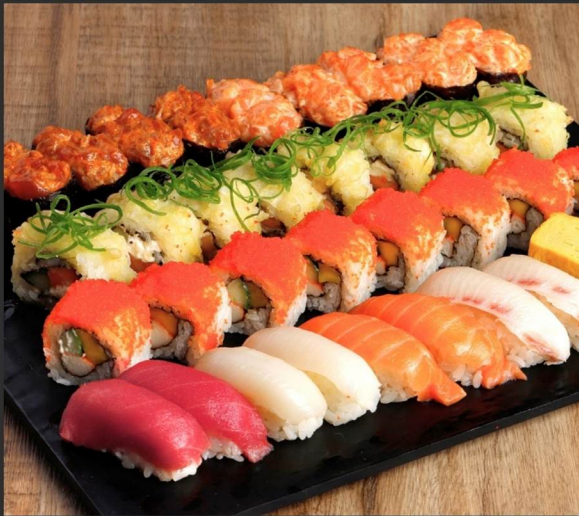
sen-ryo Platter 2300 千両プラッター 36 pcs assorted sushi · spicy salmon gunkan, spicy maguro gunkan, salmon cheese tempura roll, california roll, maguro nigiri, ika nigiri, salmon nigiri, hamachi nigiri, tamago nigiri