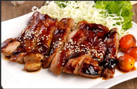
Chicken Teriyaki 680 チキン照り焼き grilled chicken with teriyaki sauce