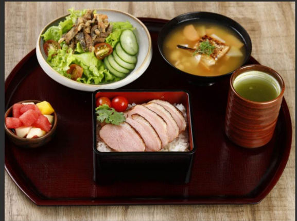
Smoked Duck Jyu 燻製鴨御膳 smoked duck, rice