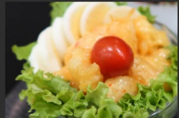
Popcorn Shrimp 650 ポップコーンシュリンプ popcorn style shrimp in special dressing