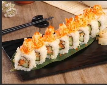
Crispy Spicy Salmon Roll 500 クリスピースパイシーサーモンロール spicy salmon, cucumber, kanikama, shrimp roe