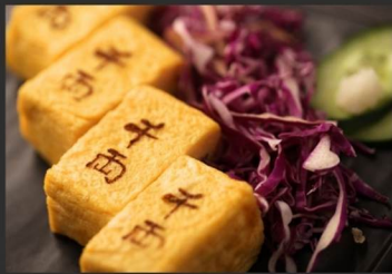
sen-ryo Omelette 290 千両厚焼き玉子 traditional Japanese folded egg