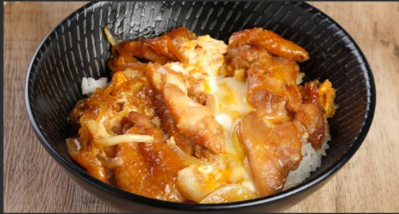
Chicken Oyako Don チキン親子丼 chicken and egg, rice