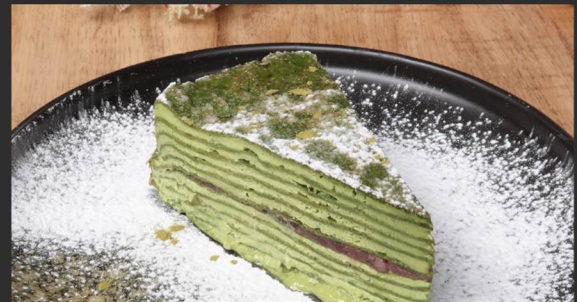
Matcha Mille Crepe 抹茶ミルクレープ