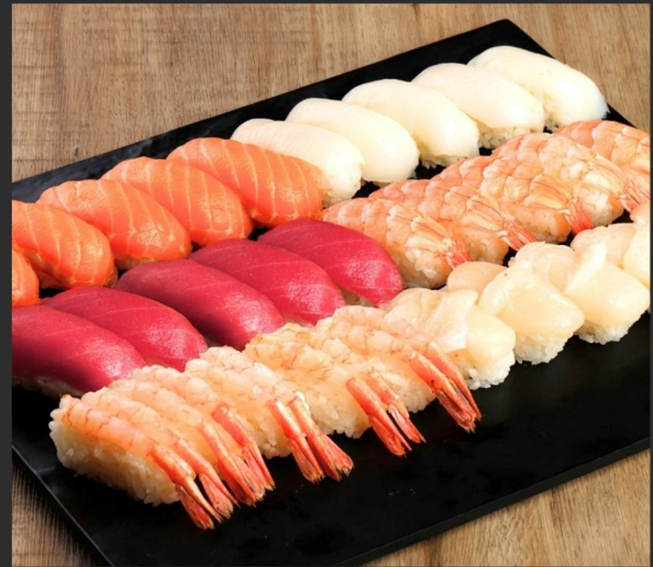
Fresh Platter 2000 フレッシュ プラッター 30 pcs assorted nigiri · maguro nigiri, salmon nigiri, ama ebi nigiri, hotate nigiri, shrimp nigiri, ika nigiri