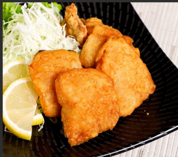
Fried Hokkaido Cod 北海道産タラの唐揚げ