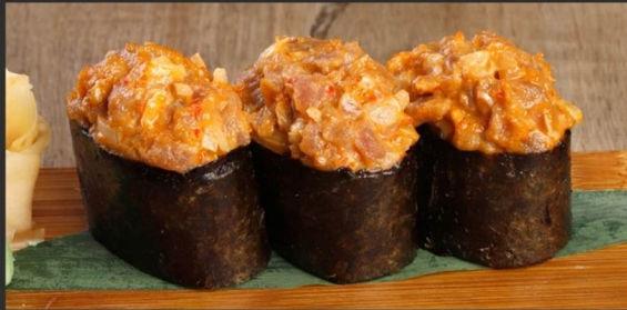
Spicy Maguro Gunkan 370 スパイシーまぐろ軍艦 spicy tuna in a thin strip of nori