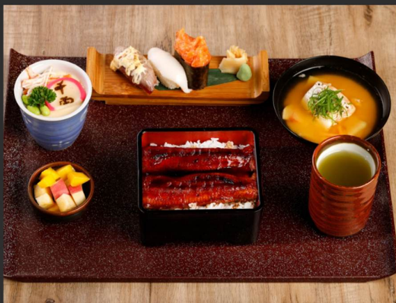
Una Jyu 鰻重御膳 unagi, rice