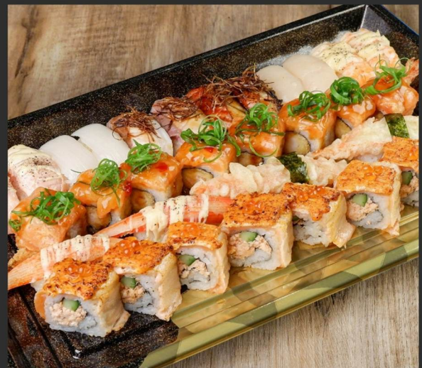
Deluxe Family Platter 3000 デラックス ファミリー プラッター 34 pcs assorted sushi · ika nigiri, tempura shrimp nigiri, hotate nigiri, seared hamachi with steak sauce nigiri, unagi nigiri, seared shrimp with black pepper nigiri, seared salmon with black pepper nigiri, seared kanikama with black pepper nigiri, spicy double salmon roll, shogun roll

Prices are inclusive of VAT. Prices and availability are subject to change without prior notice. These items are for takeaway only. Please be aware that our products may contain common allergens such as eggs, soy, shellfish. etc.