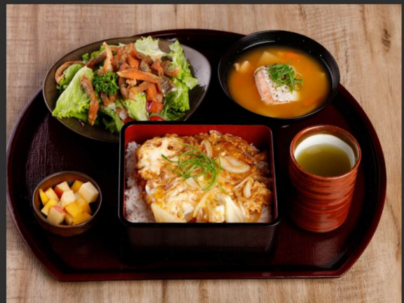
Pork Katsu Jyu ポークカツ重御膳 pork katsu and egg, rice