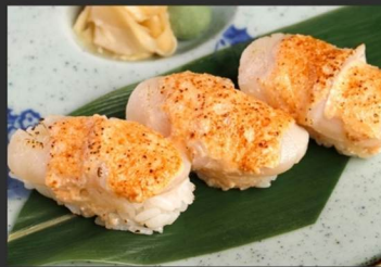
(〒) Seared Hotate with Pollock Roe Nigiri ほたて明太炙り seared Hokkaido scallop with pollock roe and mayo 440