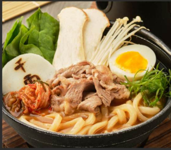
千 Wagyu Beef and Kimuchi Udon 950 和牛キムチうどん udon with wagyu beef and kimuchi