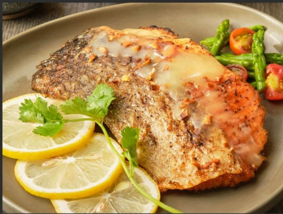
Pan-seared Garlic Butter Salmon 890 サーモンのガーリックバター焼き grilled salmon with garlic butter sauce