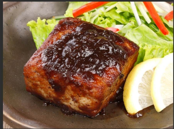
🍴 Pan-seared Maguro with Steak Sauce 850 まぐろのステーキソース焼き grilled tuna with steak sauce