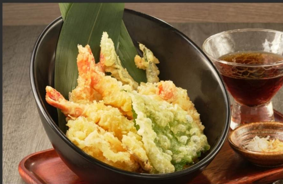
Assorted Tempura 720 天ぷら盛合せ mixed tempura served with tempura sauce