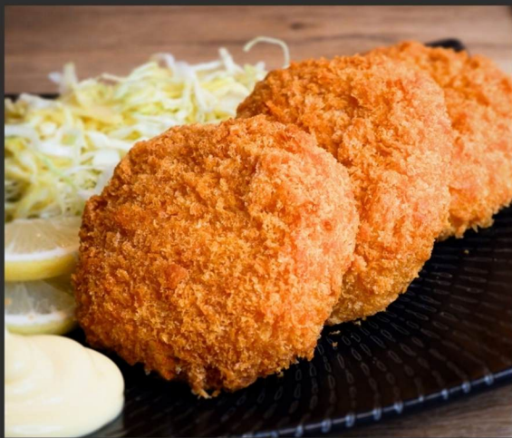
Cheese Croquette 520 チーズコロッケ deep fried potato croquettes with cheese