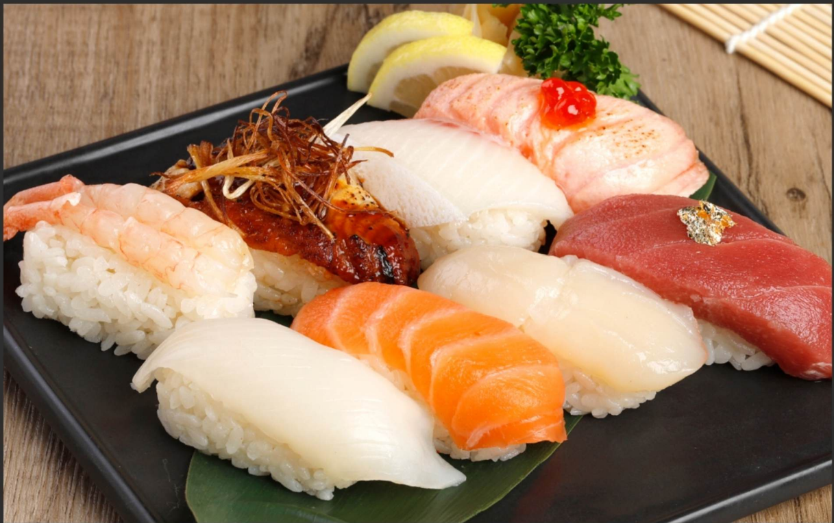
Signature Nigiri Set 特選握りセット 8 kinds of nigiri