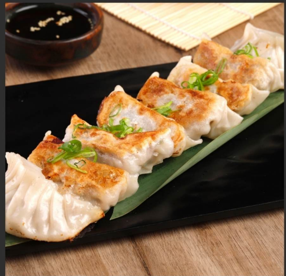
Gyoza 餃子 pork gyoza