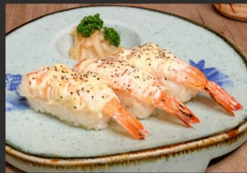
Seared Shrimp with Black Pepper Nigiri えびブラックペッパー炙り seared shrimp with black pepper and mayo 340