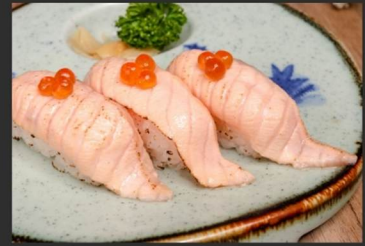
Seared Salmon Supreme Nigiri 極上とろサーモン炙り seared salmon topped with salmon roe 340