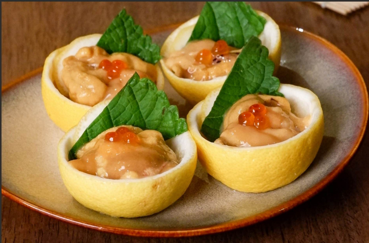
Uni Sashimi 雲丹