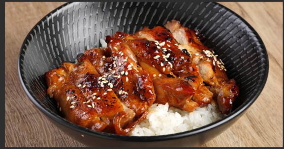
Chicken Teriyaki Don チキン照り焼き丼 grilled chicken in teriyaki sauce, rice