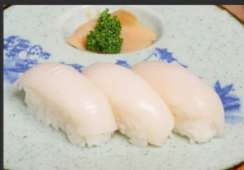
Ika Nigiri いか squid