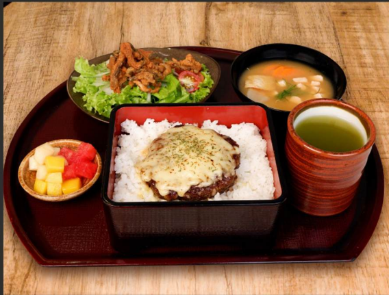
Wagyu Beef Hamburg Jyu 和牛ハンバーグ御膳 wagyu beef hamburg, rice

includes salmon skin salad, rice, miso soup, fruit, tea