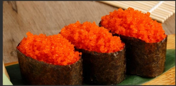
🍣 Shrimp Roe Gunkan 390 えびっこ軍艦 shrimp roe in a thin strip of nori