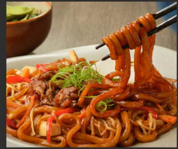
Wagyu Beef Yakiudon 1050 和牛焼きうどん stir-fried udon with wagyu beef