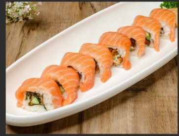
sen-ryo Roll 600 千両ロール salmon skin, salmon, cucumber