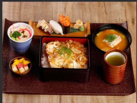
Pork Katsu Jyu ポークカツ重御膳 pork katsu and egg, rice