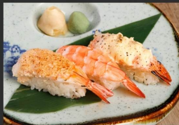
Shrimp Trio えび三昧 assorted shrimp nigiri 340