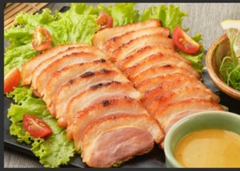
Smoked Duck 670 燻製鴨(单品) smoked duck