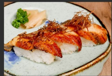
Unagi Nigiri 鰻 grilled river eel