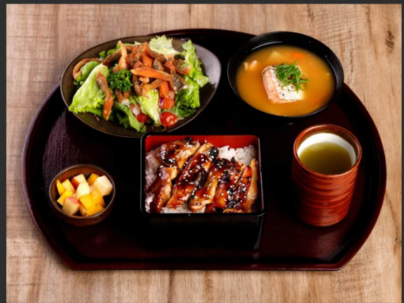
Chicken Teriyaki Jyu チキン照り焼き御膳 chicken teriyaki, rice