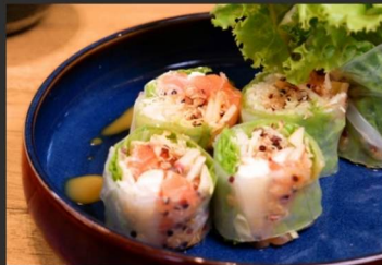
Quinoa Spring Roll 380 キノア生春巻き lettuce, quinoa, cream cheese, salmon, apple