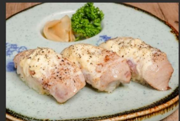
Seared Maguro with Cheese Nigiri まぐろチーズ炙り seared tuna with cheese 340