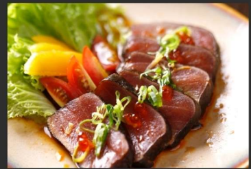
☎ Maguro Carpaccio 700 まぐろのカルパッチョ lightly seared tuna wrapped in nori and served with citrus sauce